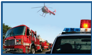
Table ES4-15: Summary of Potential Impacts, Human Health and Safety